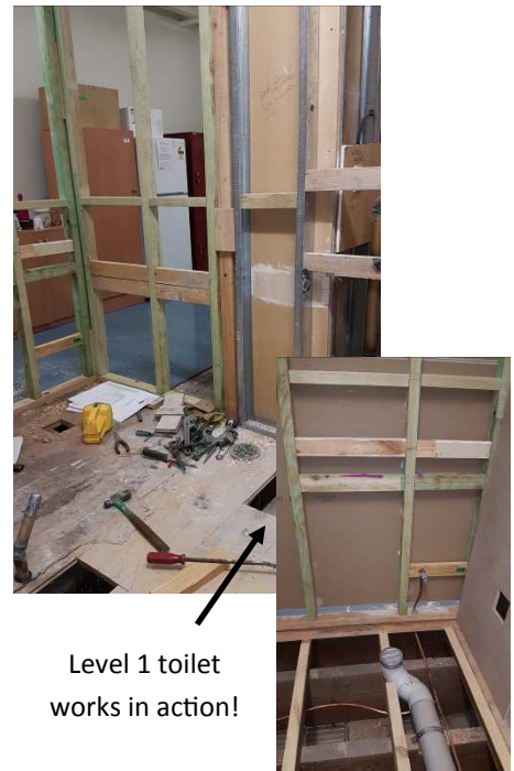
Level 1 toilet works in action!

Ross House Association continues to make incredible energy savings as a result of sustainability works to the building, behaviour change and continued commitment from the entire Ross House community. Compared to 2012 the reduction is remarkable!