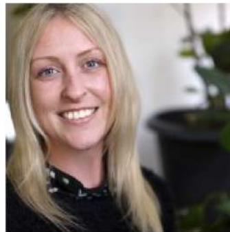
Information & Administration Officer