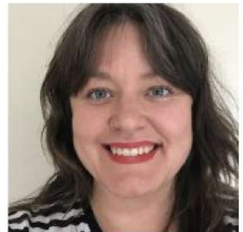
Information & Administration Officer