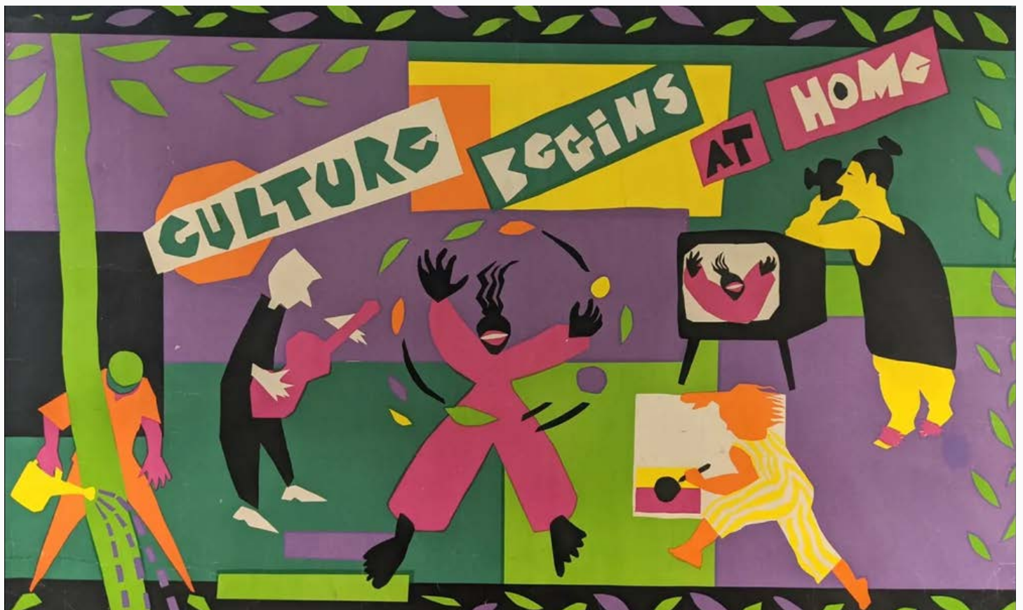
Images: Top, Hazchem House environmental justice poster. Bottom, Culture Begins at Home campaign poster.

Website: www.coshg.org.au/picturing-social-justice-project/