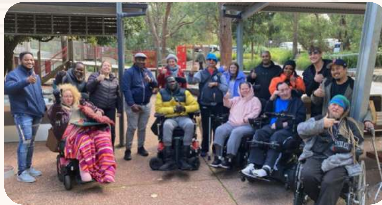
The East Metro PSG - Ringwood enjoying a BBQ at the park.

If you would like more information please contact the Brain Injury Matters office at office@braininjurymatters.org .