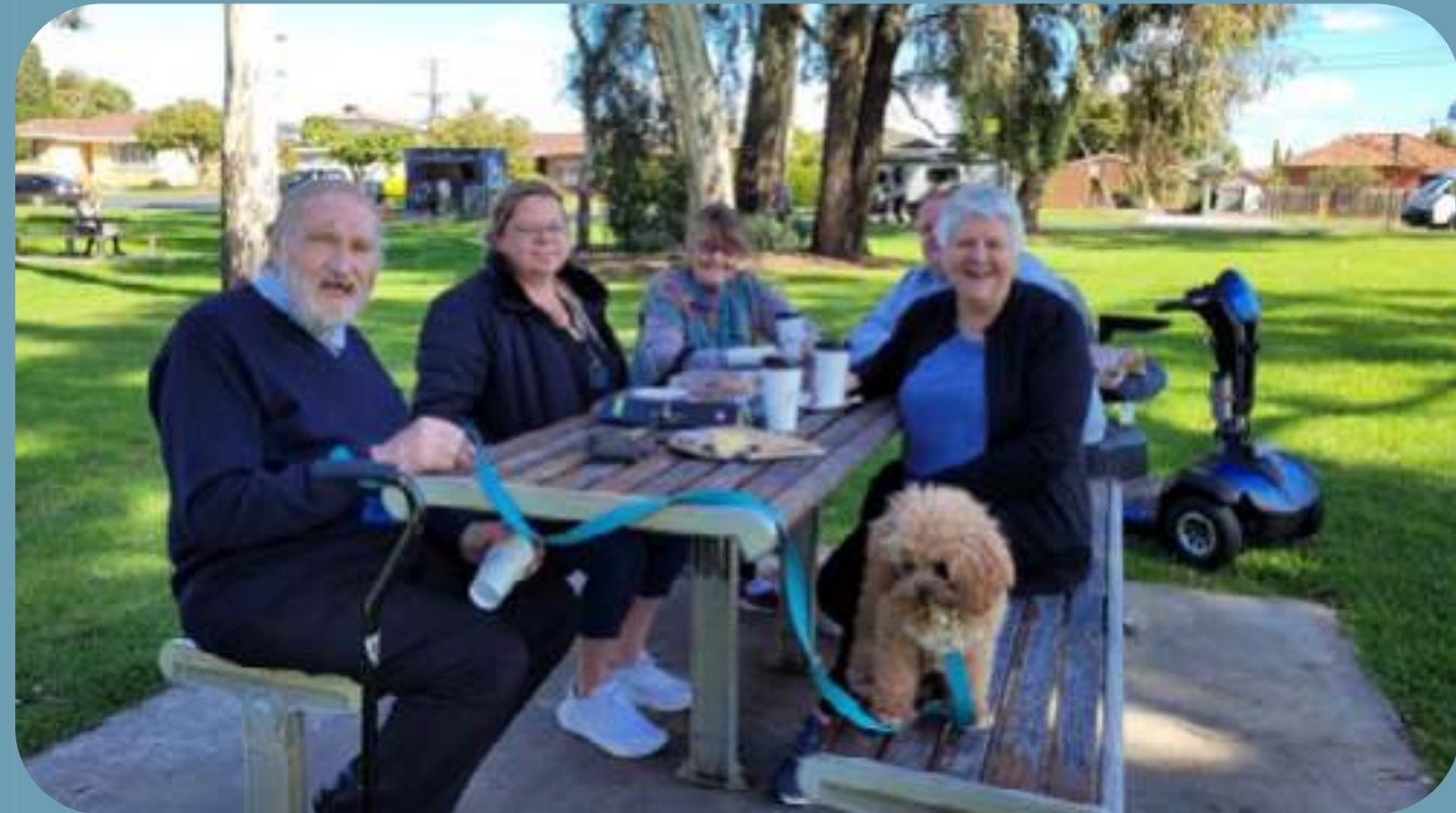
In May 2023 The Bendigo Neighbourhood Hub PSG had their first catch up.

The financial year 2022/2023 has been a big one for Brain Injury Matters! One of the many achievements, amongst a busy time of successful projects, has been the ongoing growth of our Peer Support Groups.