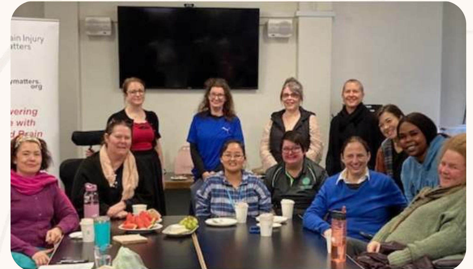
Women's Peer Support Group - Ross House, Melbourne

On the first Monday in June 2023, ten women met for the first time at Ross House. To celebrate we shared a delicious chocolate mousse cake with coffee and had a good chat.