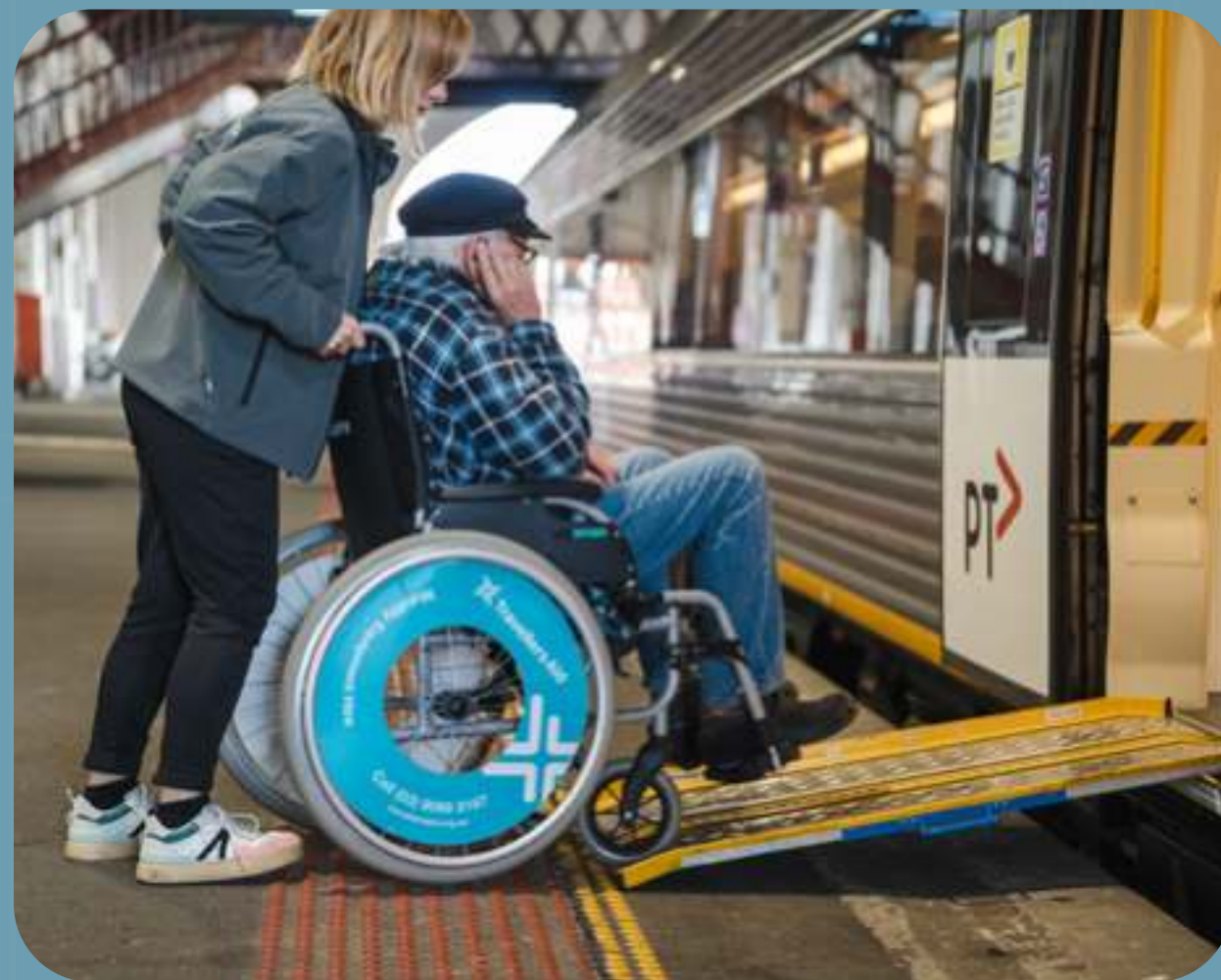
Ballarat November 2022

During the 2022-23 year, we have continued to extend our reach to support more people who face barriers to access. Travellers Aid service hubs at Flinders Street and Southern Cross Stations in Melbourne and at Seymour and Ballarat Stations in regional Victoria offer a range of services to support people transiting through the stations.