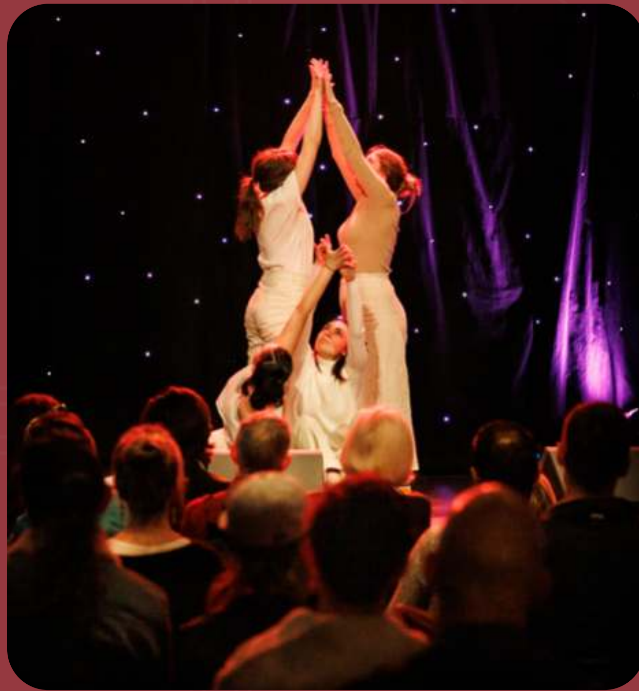
Schizy Inc

Schizy Inc (pronounced 'skitzzy ink') continues to deliver bold and innovative projects around mental health that champion lived experience through the arts.